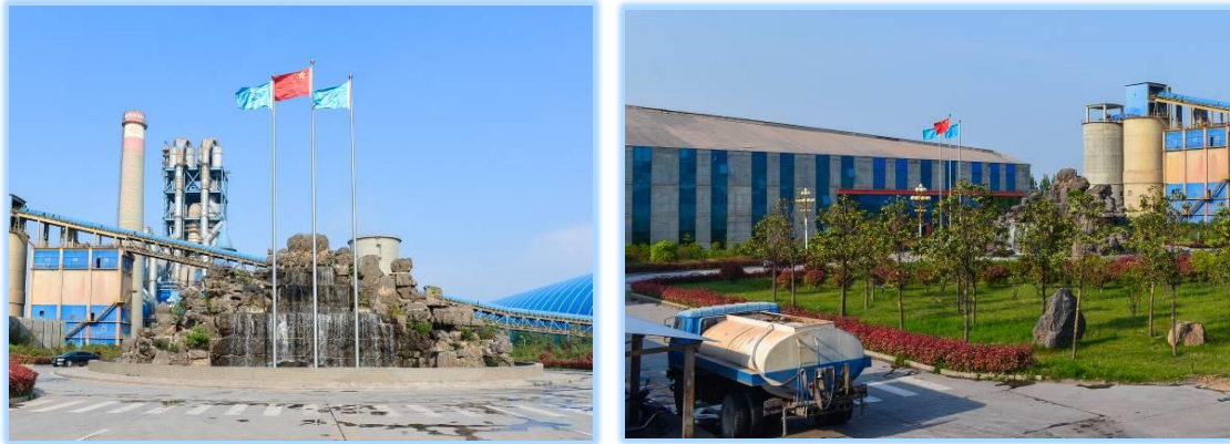
On-site landscape (left) and dust control spray (right) use recycle water from waste heat recovery system

Some of the cooling systems also use the treated industrial water from the production plant as cooling water, to avoid unnecessary extraction of water resources. Its pumping system is able to carry out filtration to ensure that water used is safe, non-poisonous and suitable to assist in production. Meanwhile, the Group has also actively used the treated water for irrigation, on-site landscape and dust control spray.