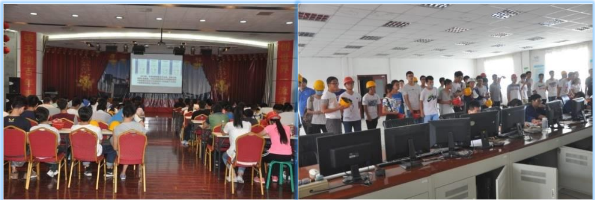
Teachers and students watched the introductory film to understand the Group and the production of cement (Left) , and visited the control room of the Group (Right)

In the year, more than 70 students and teachers from North China University of Water Conservancy and Electric Power visited Tianrui Group Zhengzhou Cement Company Limited to conduct site visit and study. The Group arranged an introductory film and safety training for teachers and students in the multi-function hall. In order to deepen the students' understanding, the employees led the students to the warehouse and control room, and explained in details the latest dry process of cement production along the walkway. In addition, the employees also introduced processes such as raw materials preparation, clinker calcination, cement grinding and cement shipments etc. to students, and answered student questions.