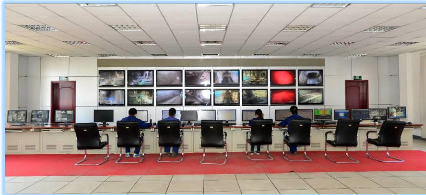
Control room for immediate monitoring of production quality

The Group has in particular set up quality control departments for product quality checks and ensured employees are fully capable in carrying out quality works. The Group conducts chemical and physical analysis activities every six months. The quality control departments of the subsidiaries arrange relevant individual to participate to sharpen the skills of the inspectors. In addition to the internal analysis activities, the quality control department of Liaoyang Tianrui Cement Company Limited has achieved excellent result of the "特等奖"(the Grand Prize) in 2016 in the “全国第十五次化学分析大对比” (the country's fifteenth chemical analysis competition).