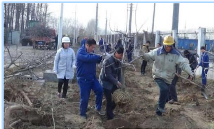
To restore the natural environment of mining areas through plantation

Limestone mining, which involves blasting, drilling and excavation, and hence will alter the landscape and destroy the natural environment. The Group is aware of the impacts, therefore it has encouraged every subsidiaries to initiate afforestation activities and repeatedly conducted afforestation and landscaping activities during the year to restore the natural environment. The Group has organized a total of nine afforestation activities, and planted grass seeds and fruit trees in wasteland of the production plants. For example, through the afforestation activities, Tianrui Group Yuzhou Cement Company Limited hopes to enhance the environmental awareness of its employees, and use wasteland effectively. During so, the employees have planted more than 200 apple trees and more than 100 Magnoliae trees to effectively utilize wasteland in production plant.