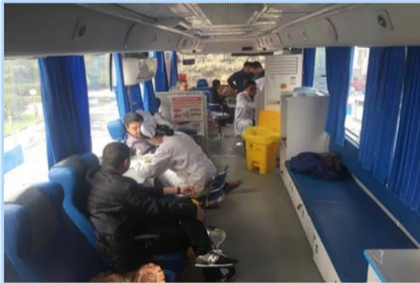
Employees of Tianrui Group Zhoukou Cement Company Limited actively participated in blood donation activities

Blood inventory guarantees the quality of medical services in the community, which allows the patients to receive adequate blood supply during surgery and proper treatment immediately. Since blood has no substitute and a short shelf life, medical institutions face difficulties in ensuring adequate reserves. Therefore, employees of Tianrui Group Zhoukou Cement Company Limited have actively participated in the blood donation activities, hoping to relieve the pressures on blood inventory. Many employees have involved in the event, to show support and contribute to a good cause.