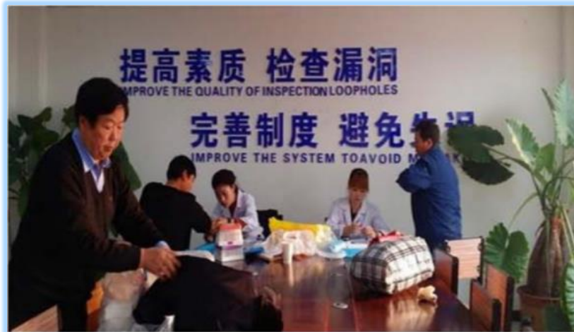
Tianjin company's physical examination

The Group also concerns about the health and safety of employees and conducts one to two occupational health examinations every year. The Group's Tianjin company has invited the medical specialists of the district to the production plants to conduct annual occupational health examination. Major medical examination includes ear, electrocardiogram, blood, lung function and DR chest X-ray etc.. Medical specialists also share their health related knowledge to employees, to enhance their awareness of occupational safety and health.