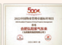
2022中國物業管理卓 越標桿項目—合肥 弘陽紫氣東來