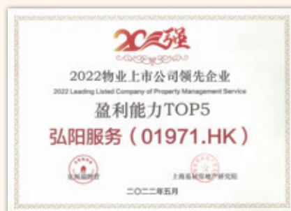
2022物業上市公司領先企業 — 盈利能力TOP 5