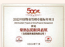
2022中國物業管理 卓越標桿項目— 常熟弘陽和風名築