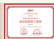
2022年度服務力標桿 項目—南京弘陽 愛上花園