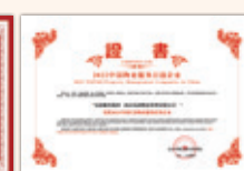
2022中國物業服務百強 企業—2022中國紅色 物業服務優秀企業