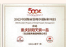
2022中國物業管理 卓越標桿項目— 重慶弘陽天宸一品