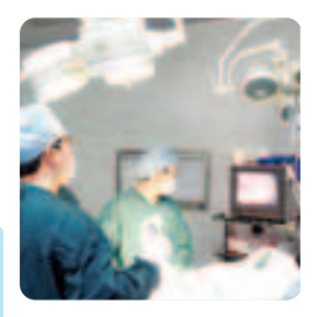
Medical Treatment Solution