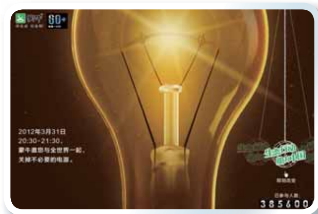
Participated in the "Earth Hour" (地球一小時) activity 參與「地球一小時」熄燈活動

蒙牛在年內對質量安全管理體系投入了大量的資源，包括聘請國際快消品行業品質管控專家、在各運營環節增加品質檢測人員及設備、加強員工質量檢驗技能的培訓等，全面提升蒙牛的質量管理水平。