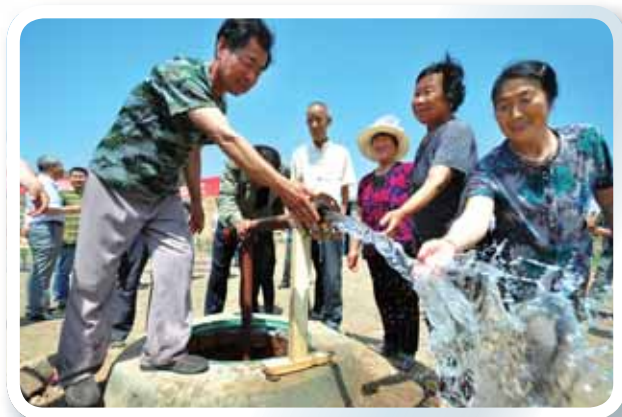
Continued to build the "Charity Well" (愛心井) 持續建設「愛心井」