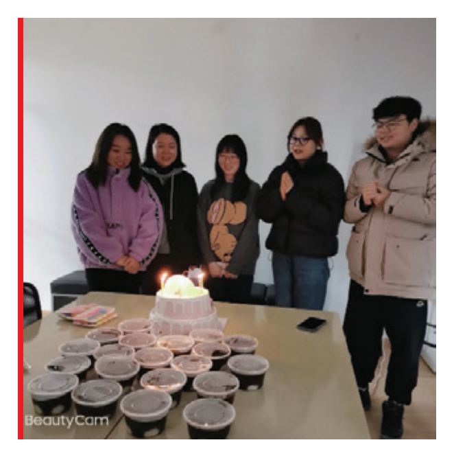
Birthday party at Nanjing subsidiary

We organise themed activities for our staff during festivals such as the Lantern Festival, International Women's Day, Children's Day and Thanksgiving, and we also host birthday parties on a regular basis to convey warm wishes to our staff. These exuberant festive and birthday celebrations have provided staff with a homelike, heartwarming experience and enhanced their sense of belonging.