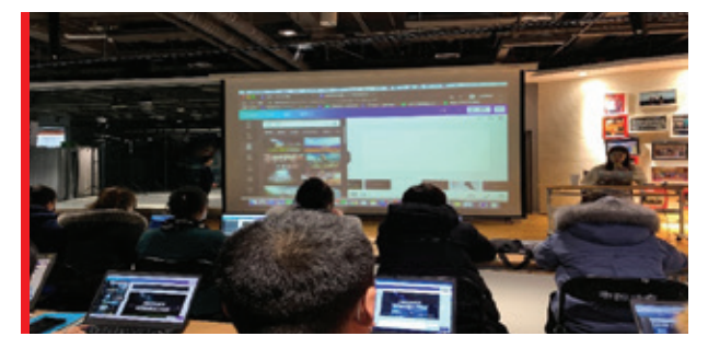
Skill training session organised by the Group