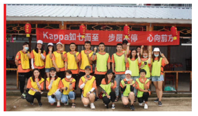
Fun outing at Harbin subsidiary

We organise a variety of interesting team building activities to promote work-life balance. During the financial year, our staff actively participated in team building activities and our team cooperation and solidarity has been enhanced as a result.