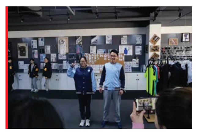
Students visiting our Taicang Factory

The Group is committed to the grooming of talents needed by the society, with a special emphasis on social exposure for students at school, as evidenced by a variety of school-business cooperation initiatives. During the year, the Group worked actively with secondary schools in the neighbouring areas of operations and arranged site visits for secondary-school students so that they could learn about the production process of apparel products.