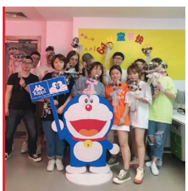
Children's Day celebrations at Hangzhou subsidiary