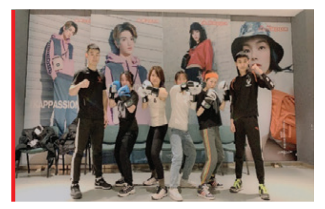
The Fight Club

In line with our emphasis on comprehensive staff development, a variety of cultural and sporting activities are organised with the aim of showcasing the flairs and talents of our colleagues. In FY2020, various cultural and sporting events were organised. They included the newly instituted Fight Club, runs, integrated military and outward-bound training, the Dongxiang Badminton Tournament and floral arrangement classes, to name but a few. Such cultural and sporting activities in all their variety have been highly appreciated by our staff, who have enjoyed great times of relaxation and fostered closer friendship with fellow colleagues through vigorous involvement.